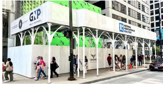
430 North Michigan Avenue, Chicago