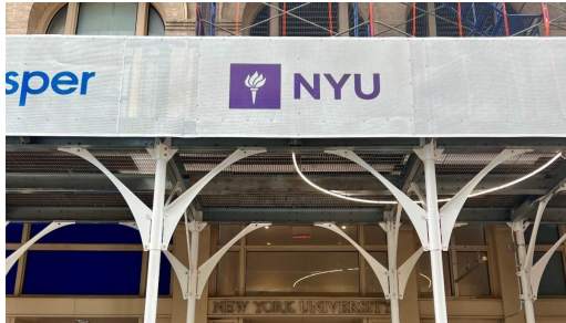
627 Broadway, Manhattan