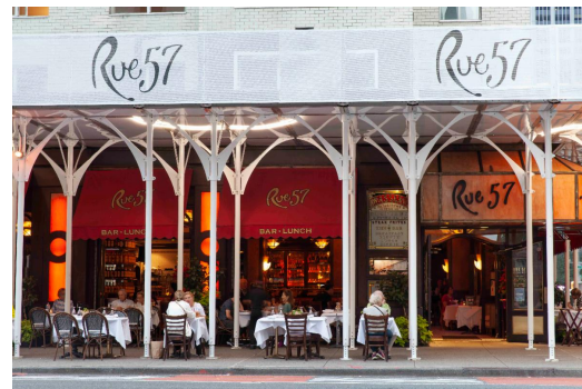
60 West 57th Street, Manhattan