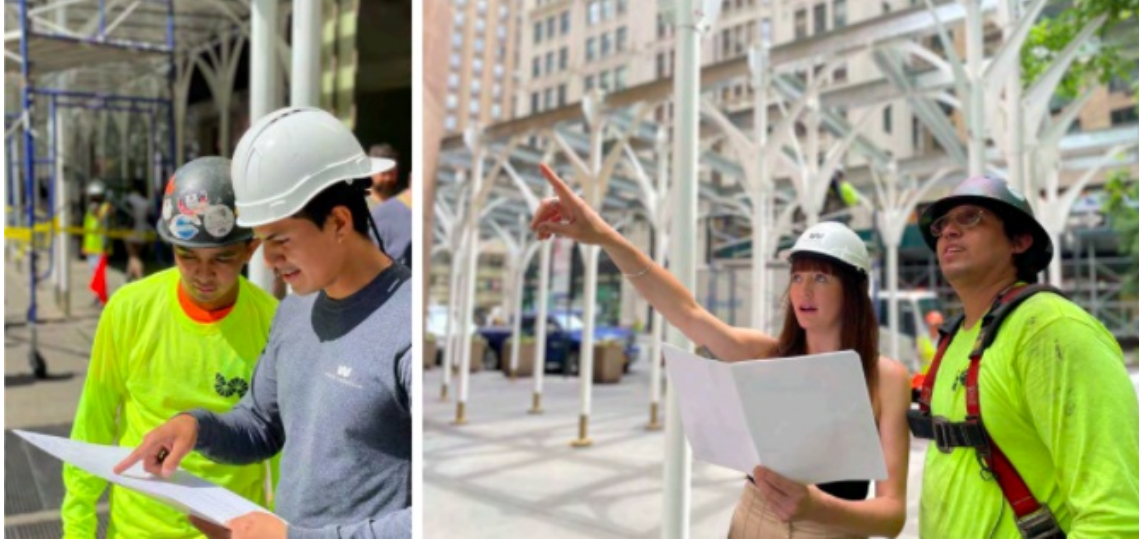
Our project managers delegating tasks and troubleshooting concerns on site.