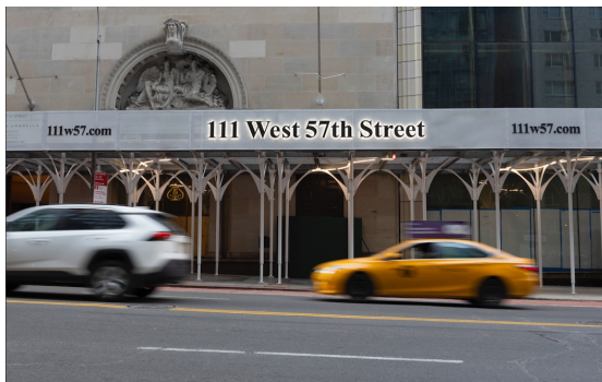
111 West 57th Street, Manhattan