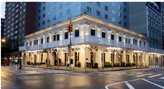
132 Fourth Avenue, Manhattan