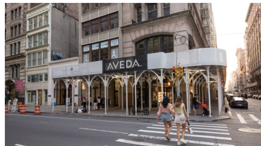
140 Fifth Avenue, Manhattan