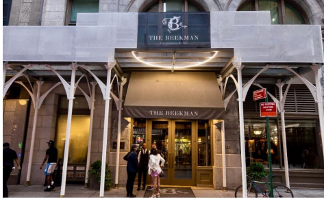
115 Nassau Street (Beekman Hotel), Manhattan