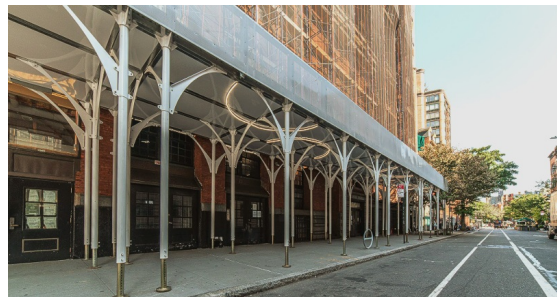
853 Broadway, Manhattan