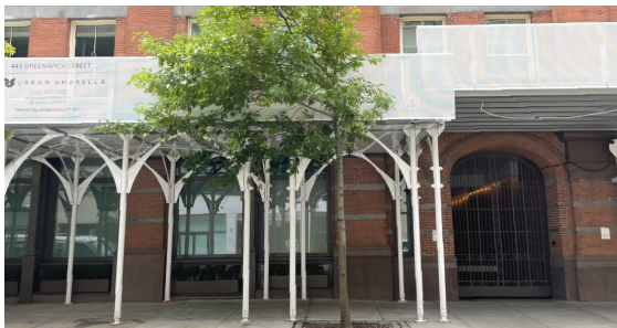
443 Greenwich Street, Manhattan