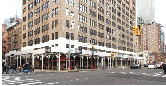
630 Ninth Avenue, Manhattan